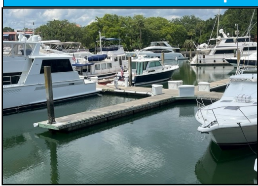
40 ft slip near Cutter Ct. $199,000