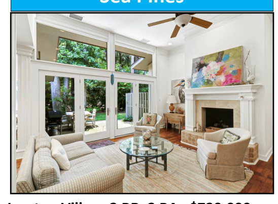
Lawton Villas - 2 BR, 2 BA $739,000