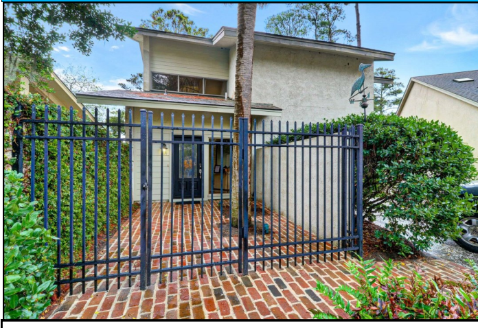
Mizzenmast Lane - 4 BR, 3.5 BA $1,250,000