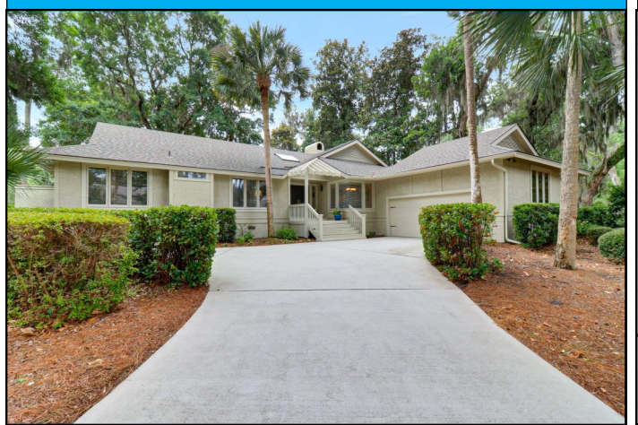
3 BR, 3 BA with garage $1,295,000