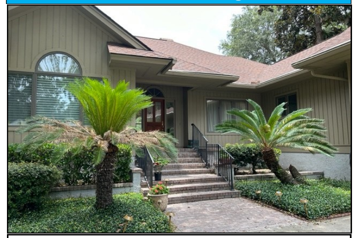
4 BR, 4 BA Lagoon & Fairway views $1,100,000