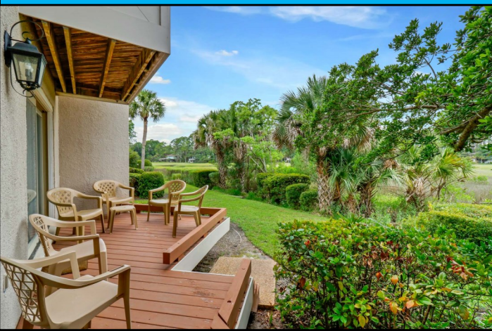
3 BR, 3 BA with expansive marsh views $830,000 F